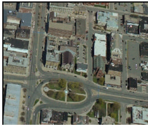
Sample Pictometry Image of Park Square in Pittsfield