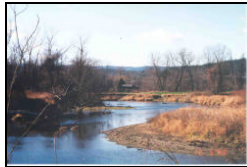
Late Autumn along the Housatonic River