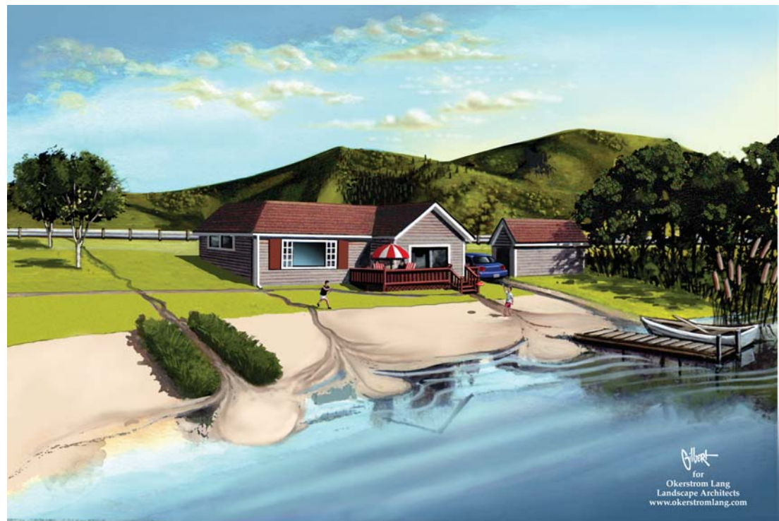
Artist renderings supplied by Okerstrom Lang, Ltd., 2003