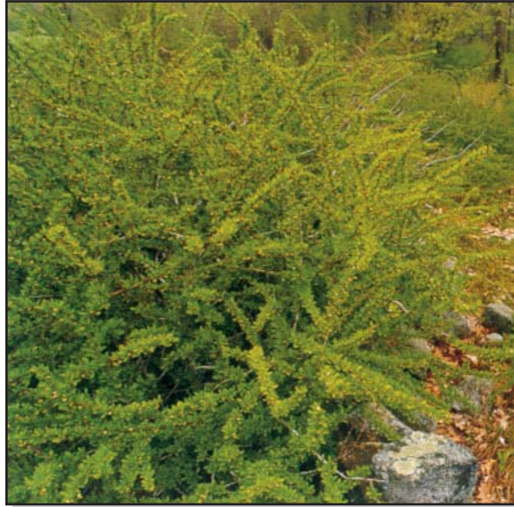
Japanese barberry ( Berberis thunbergii )