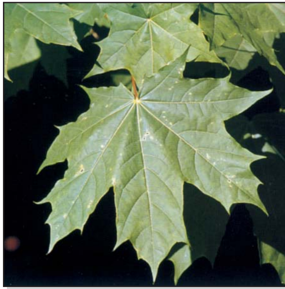
Norway maple ( Acer plantanoides )